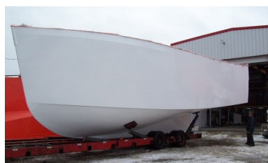
LeBlanc 45' Crabber

The boat is expected to be completed and delivered by April.