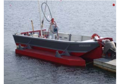
Experimental platform for oil recovery

This unusual looking craft is an experimental platform for an oil spill recovery system. North Atlantic Yachts recently completed modifications to the barge for Extreme Spill Technology of Sussex, NB. In order to have a non-polluting test, oranges are used as they have about the same density as oil. The barge is currently conducting tests in Halifax Harbour.