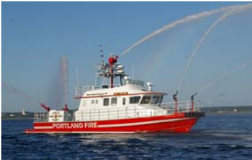
City of Portland

Equipped as a sea-borne ambulance, this boat has a fully-equipped medical bay that is a duplicate of the modern Portland emergency services ambulances. This will allow EMT's to come aboard the vessel