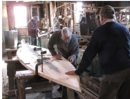
Build a dory in Lunenburg

The Dory Shop now offers dory building classes in Lunenburg. Held this year in Spring and again this October, the courses are open to those with basic woodworking skills.